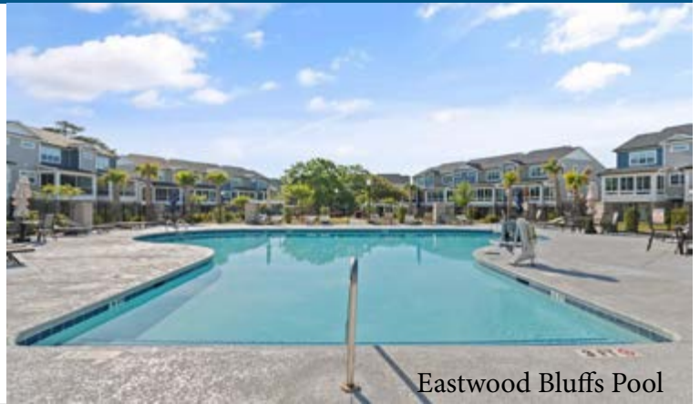
Eastwood Bluffs Pool