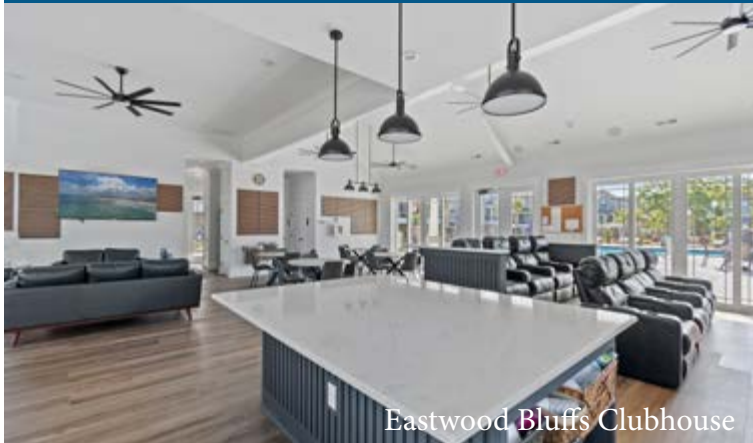
Eastwood Bluffs Clubhouse